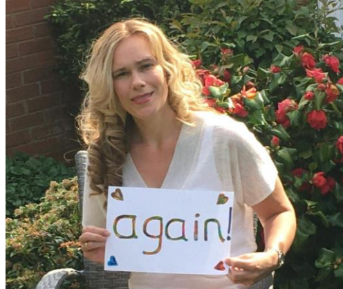
Miss Dyke Class 5