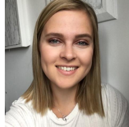
Miss Knowles Class 4