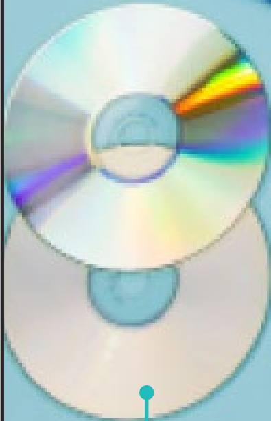
2 old CDs